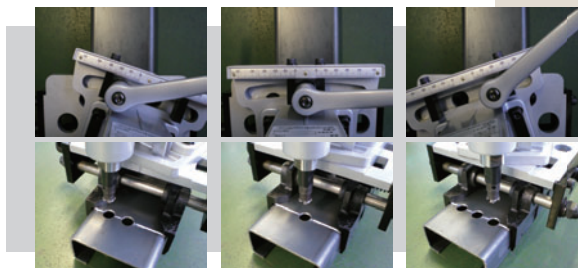
The point of a sword does parallel move when turn a base.